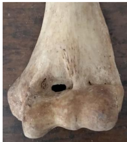
Fig6: Rectangular shape