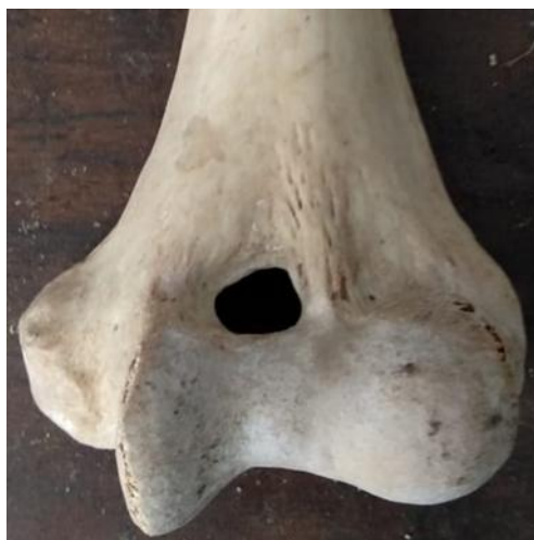
Fig2: Irregular shape