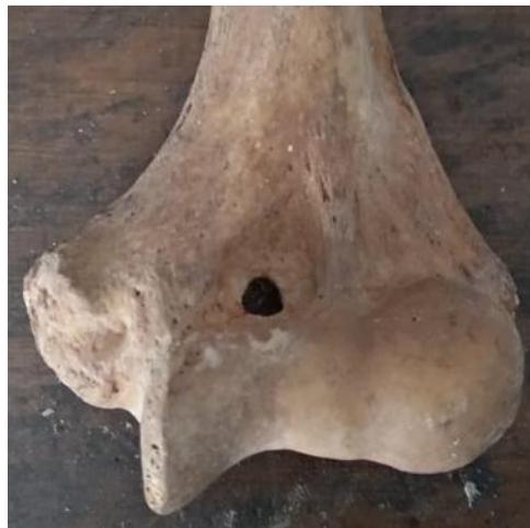
Fig5: Triangular shape