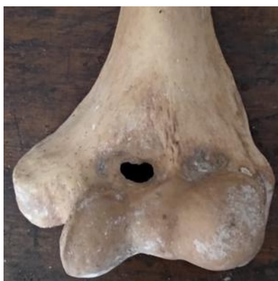
Fig 3: Reniform shape