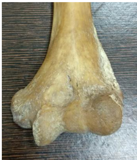
Fig1: Absence of supratrochlear foramen

The photographs of variation in shapes of supratrochlear foramen found in the humeri were given below