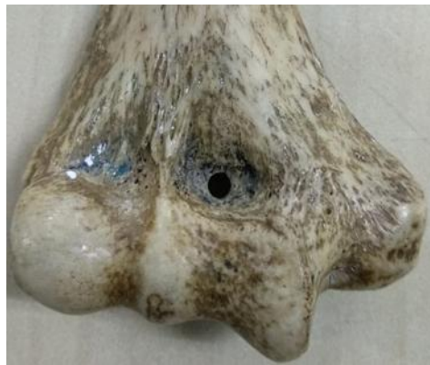
Fig4: Round shape