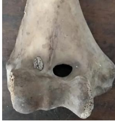
Fig7: Oval shape