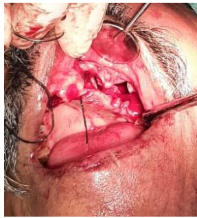
Figure 4: Intraoperative – lesion removal