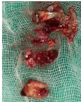
Figure 5: Pathology with root stumps

The exposed sequestrum was removed along with the decayed root stumps and histopathologic diagnosis was chronic suppurative osteomyelitis. [Figure 4,5]