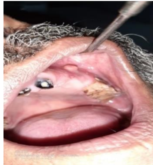
Figure 1: Multiple pus discharging sinuses

mobility of all the maxillary teeth, associated with bone exposure (sequestrum) in the left maxillary molar region on the buccal aspect