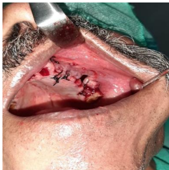
Figure 6: Closure with suction drain

The exposed sequestrum was removed along with the decayed root stumps and histopathologic diagnosis was chronic suppurative osteomyelitis. [Figure 4,5]