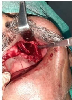
Figure 3: Intraoperative – Flap elevation and exposure of the lesion

The provisional diagnosis was osteomyelitis of the maxilla with spontaneous sequestration. An incisional biopsy and a culture and sensitivity test were performed under local anesthesia, after getting the blood examination done and under antibiotic coverage (amox + clav and metrogl). [Figure 3]