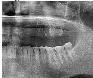
Figure 8: OPG after 6 months

with betadine was being performed on a daily basis and drain was removed on 4th postoperative day and suture was removed on 8th postoperative day. The excision biopsy report confirmed the lesion to be chronic suppurative osteomyelitis of maxilla, which is obviously a rare condition. The healing was uneventful [Figure 8]. The patient is under regular follow-up.