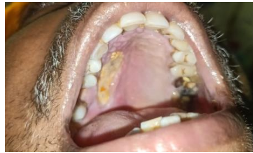
FIG. 3: Clinical Examination Showing Lesion Covered with Grayish White Slough